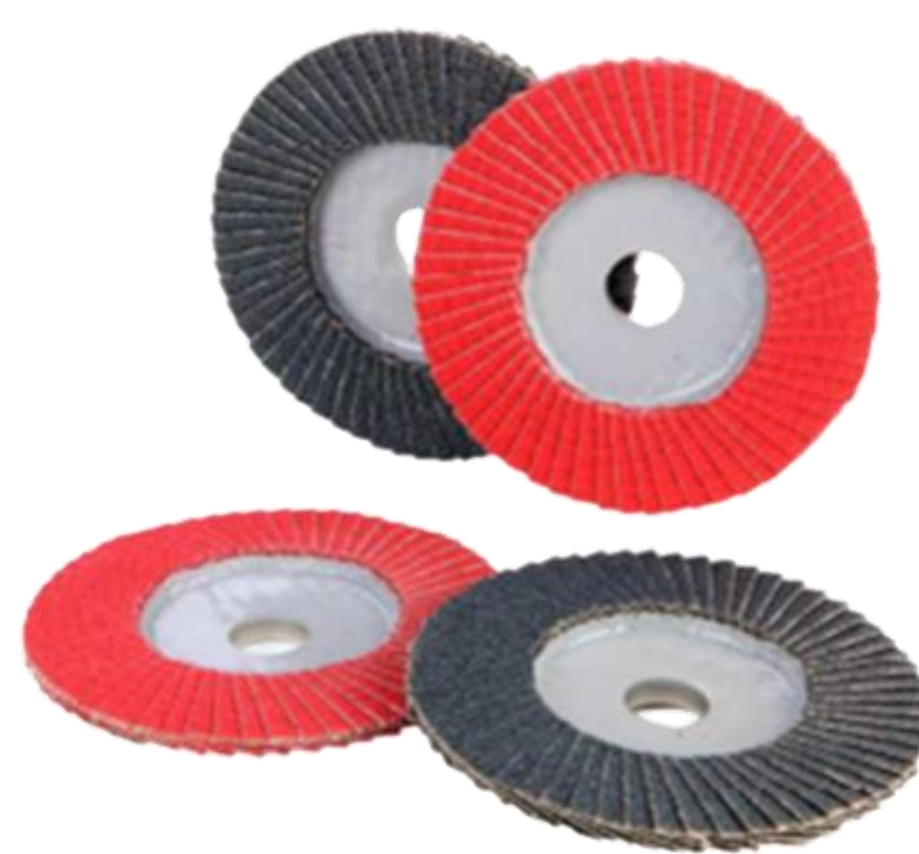
▲ Flap Disc(Glue Type)