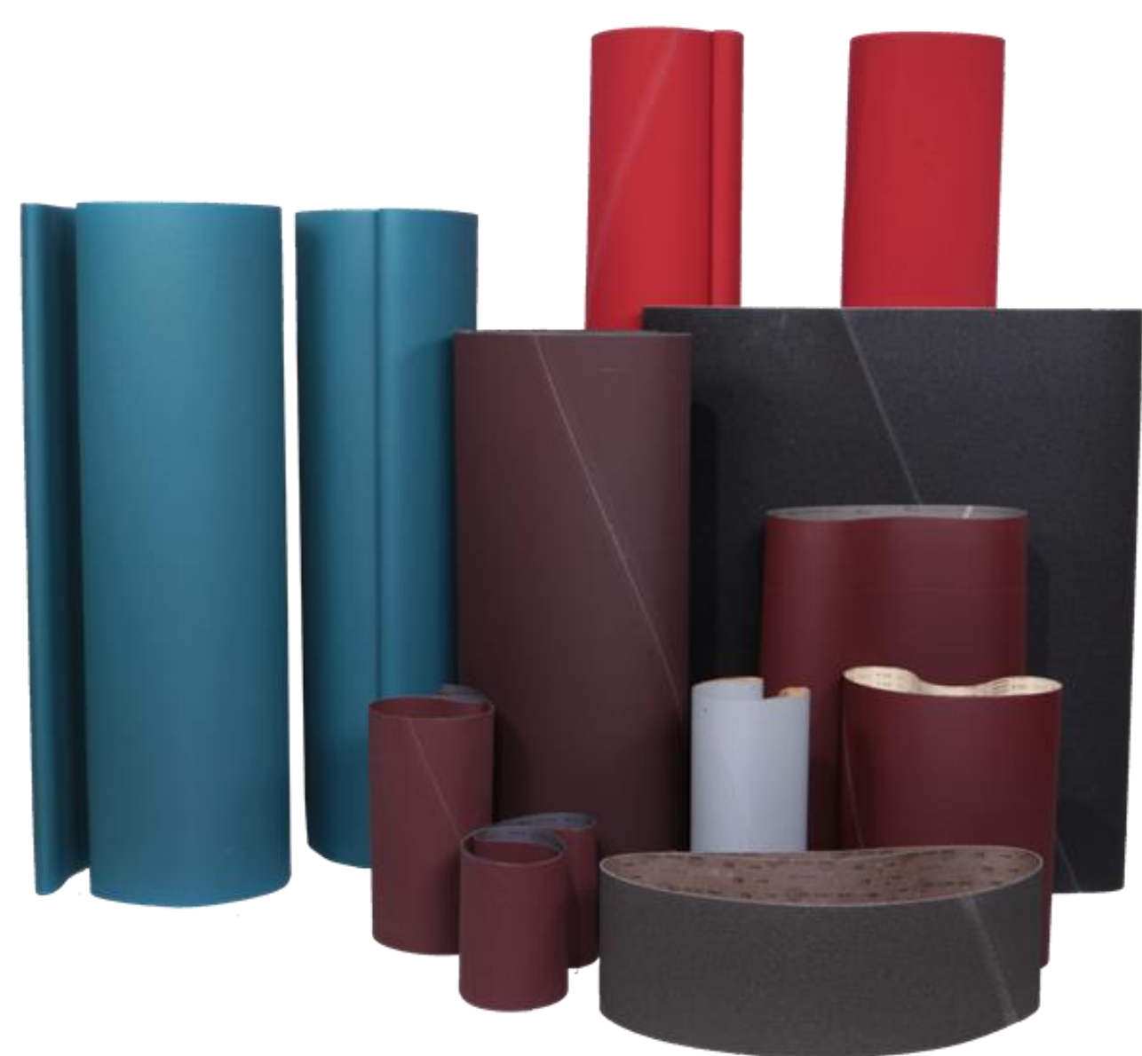
▲ Abrasive Belts