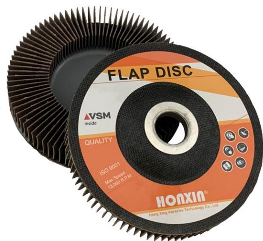
▲ Flap Disc