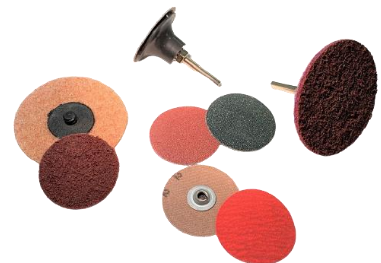
▲ Quick Change Disk